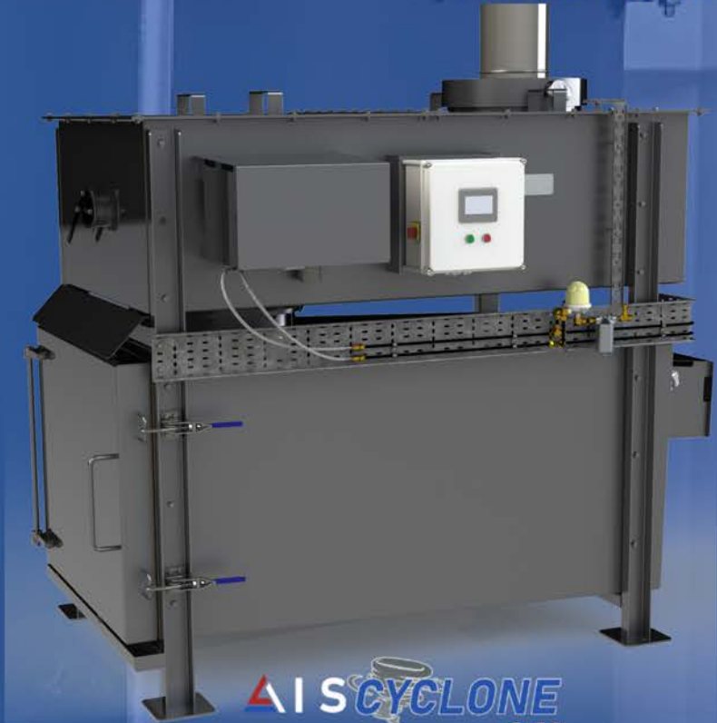
AGRI AIS CYCLONE 041

The AIS 041 Cyclone is the larger of our two front loading models and is Ideally suited for communal cremations or for single larger pets, capable of cremating on average 4 pets per day singularly or 18 pets per day communally.