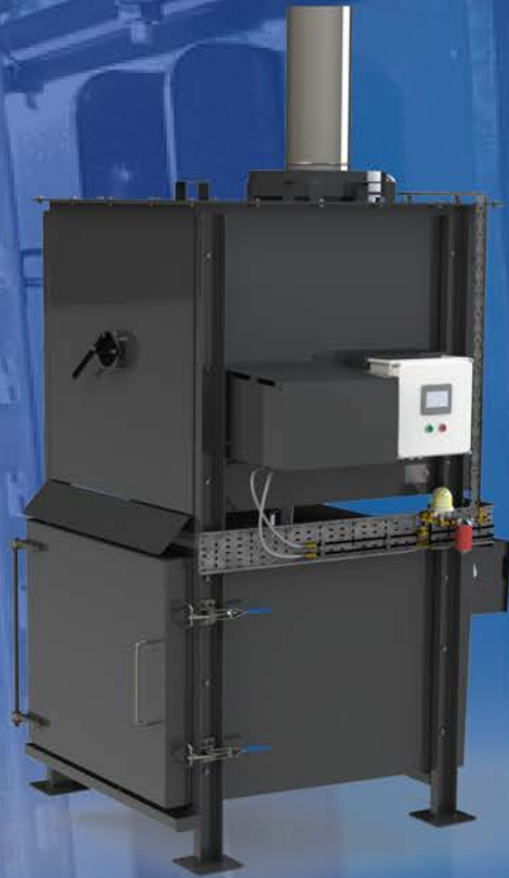
AGRI AIS CYCLONE 026

The AIS 026 is Ideal for the communal cremation of smaller pets or single large dogs, capable of cremating on average 4 pets per day singularly or 12 pets per day communally.